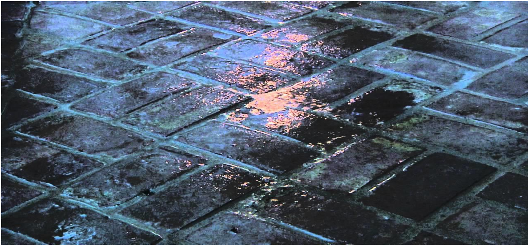
Drainage from Impervious Surfaces