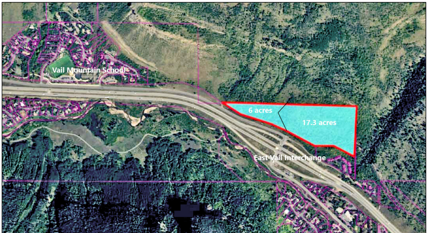
The western portion of this site is proposed for workforce housing.

Correction re: Vail Resorts’ Development Plans. Before getting to the environmental and geological issues, a correction to the original report is in order. In that report, based on what we considered to be a reputable source, VHA stated that it had been informed that VR intended to build a large scale, “Middle Creek” type, project on the order of 300 units and 5 to 6 stories high. Vail Resorts has, however, emphatically stated that it has no present plans for development of the property, and that it will not make any plans until after it has obtained rezoning of the property. VHA’s mission is to protect the quality of life in Vail which is contingent upon knowing the impact that any new development will have upon wildlife, the environment and the people in our community. Sometimes we do not receive correct information. We regret if our initial reporting was, therefore, inaccurate.