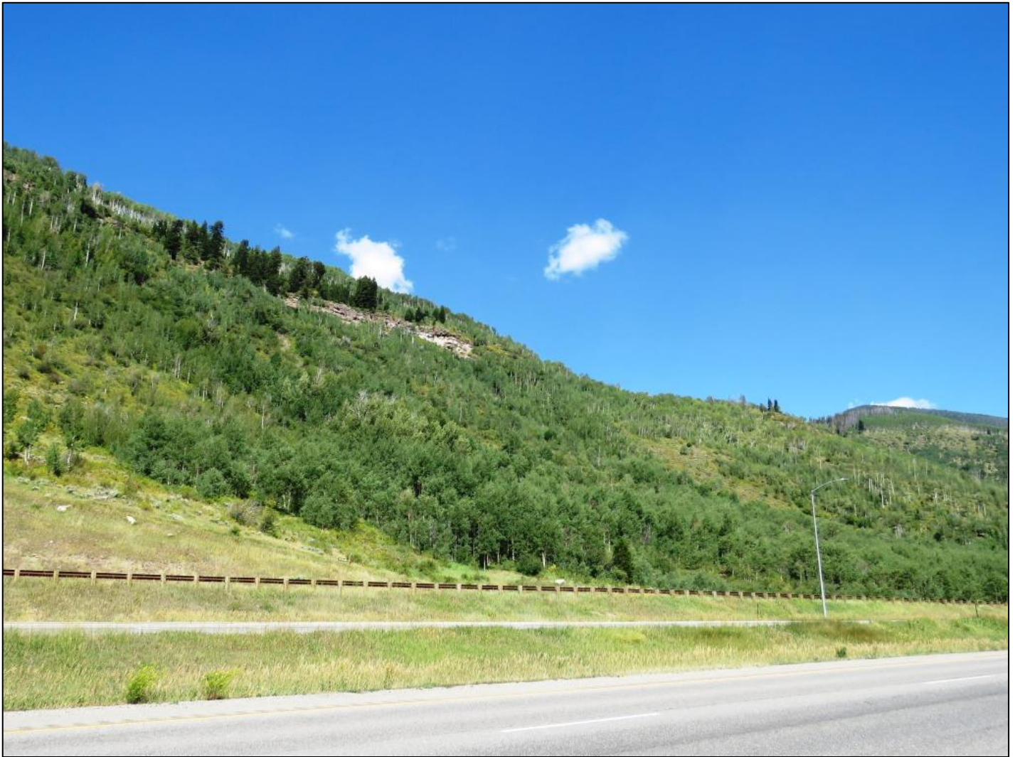
The last wildlife habitat in the Town of Vail. Is this open space about to be sacrificed for the sake of housing?