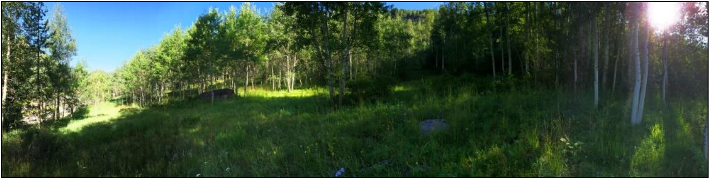
Wildlife removal awaits TOV’s approval and VR’s bulldozers.

Have the Skids Already Been Greased? It appears that VR has already cleared the way for its rezoning plans, and it is rushing to get them approved before any opposition can build or get organized. The Town Community Development Director immediately spoke positively about the plans, even promising “to do everything possible on our end” to help VR get its plan quickly approved. And, the first hearing is already scheduled in just a few weeks, on September 11 th , which indicates that a lot of behind-the-scene work has already taken place. It is probably no coincidence that all of the zoning process is scheduled to take place during September and October when many are gone, and any opposition will be at its low ebb so that it will be a done deal by the time people return for the winter season. That would mean, however, that these plans would be voted on before the upcoming Town elections.