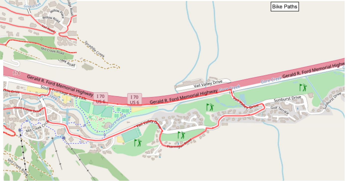
Vail Circuit – East End