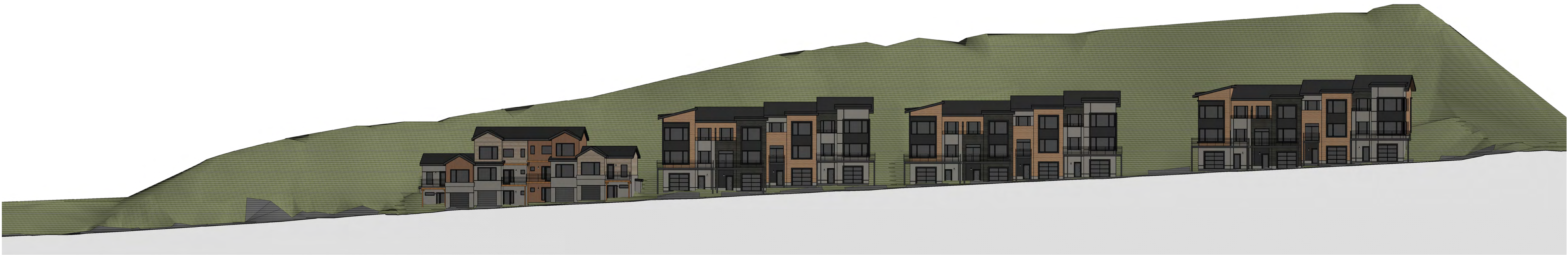
SITE ELEVATION 1 - FROM NEIGHBORHOOD ROAD