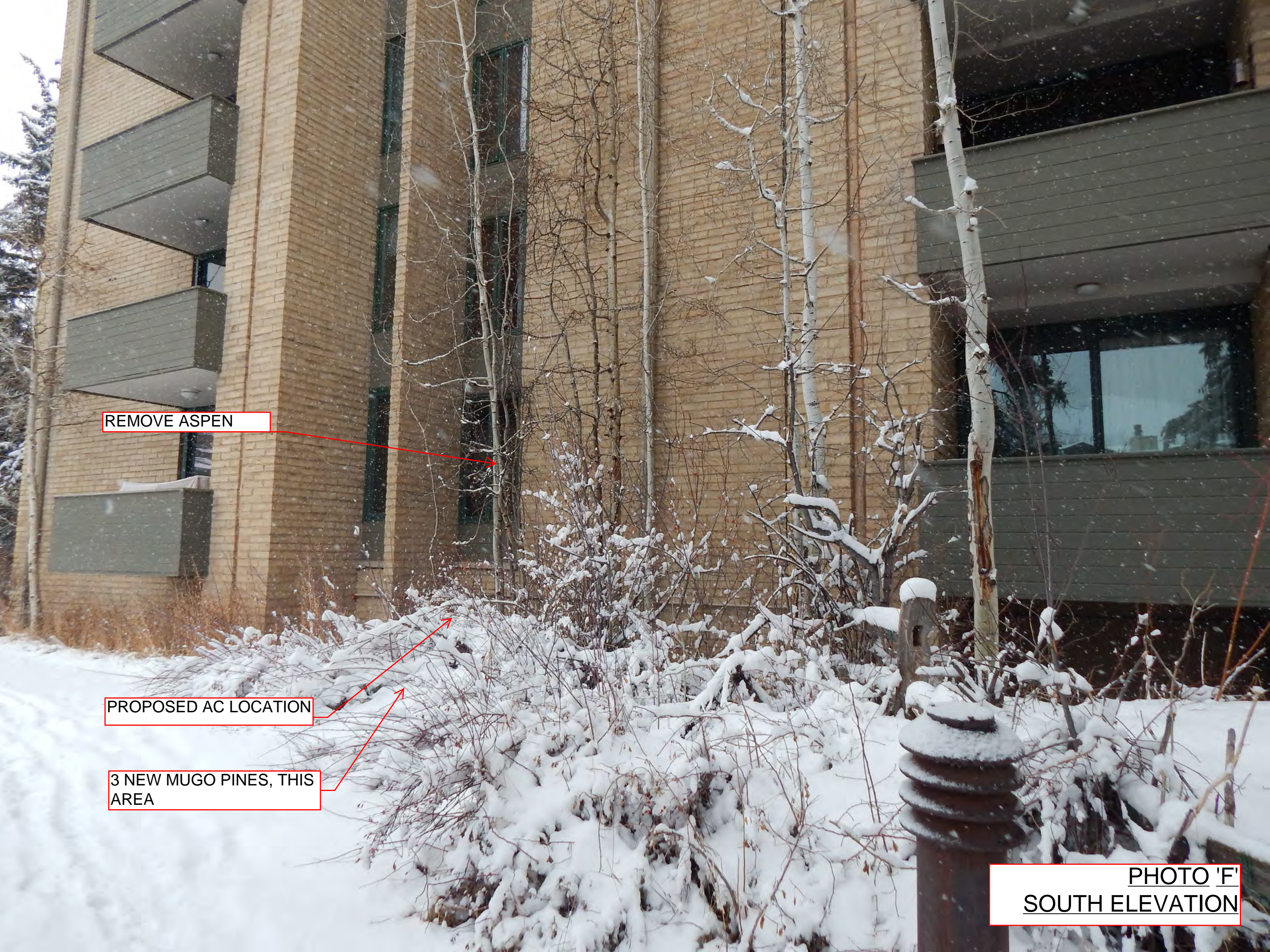
PHOTO 'F' SOUTH ELEVATION